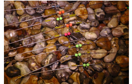
A selection of the spreaders available