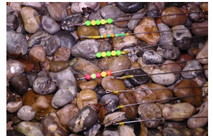
Examples of different snood attachments